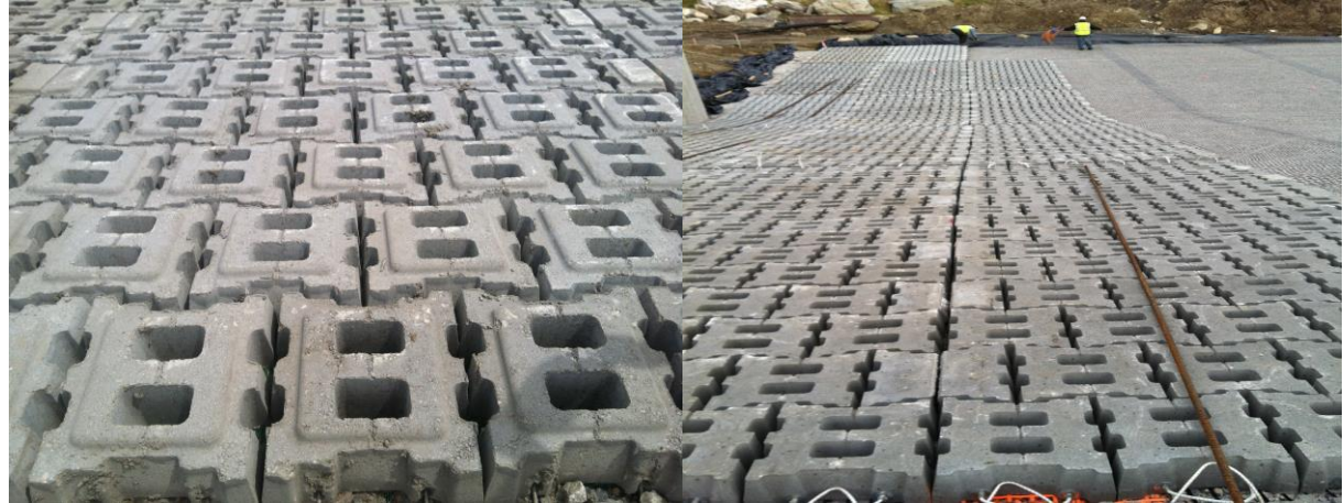
Figure 5. Interlocking Dome Top ACBs