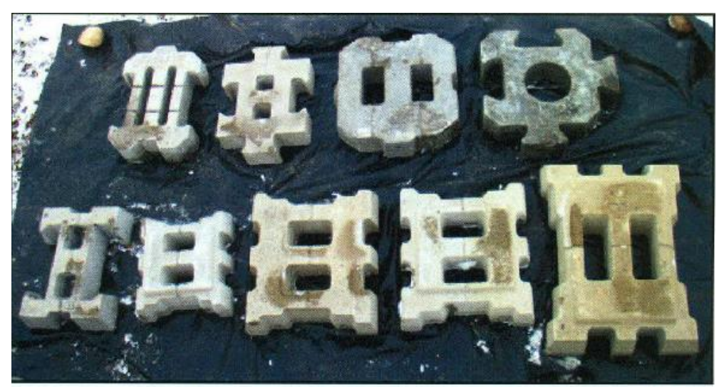
Figure 3. Typical ACB Systems currently available on the open market

its thickness can vary by 12.5 mm along the direction of flow (tapered ACB). Examples of modern ACBs are shown in Figure 3. Every ACB system is unique and needs to have full-scale flume testing results to determine the performance parameters that can be reliably used by the design engineer.