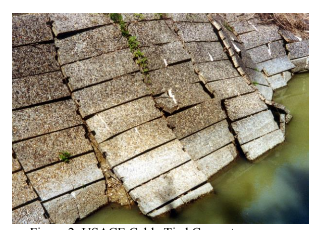
Figure 2. USACE Cable Tied Concrete

ACBs present in today's market are typically cabled systems of varying geometric shapes and have varying hydraulic performance thresholds. Typical modern ACB units range in area from 0.093 m<sup>2</sup> to approximately 0.28 m<sup>2</sup>, in thickness from 7.62 cm to 22.9 cm, and in unit weights from 98 kg/m<sup>2</sup> to 440 kg/m<sup>2</sup>. Modern ACB systems can be manufactured either by the dry cast or wet cast method. ACB revetment systems can have the individual blocks arranged within the mats in a linear or staggered format, can have the individual units interlocked, and may have the cable either cast into the blocks or inserted after the block has been manufactured. ACB revetments can have "dome" tops or flat tops, and